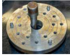
Spike drive, with center post